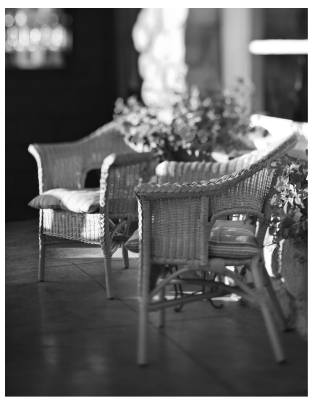
A little spray paint or some new cushions can refresh older patio furniture and give the outdoor space a completely new look.

The cost of patio blocks depends on the material