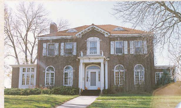
Kabeiseman-Nelson Funeral Home

The funeral home was originally called Kabeiseman-Nelson Funeral Home. The business took on several different names throughout the years as several partners joined/left the firm. In 1963, the Tabor and Yankton