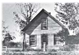
First church in the Dakotas, 4th & Linn