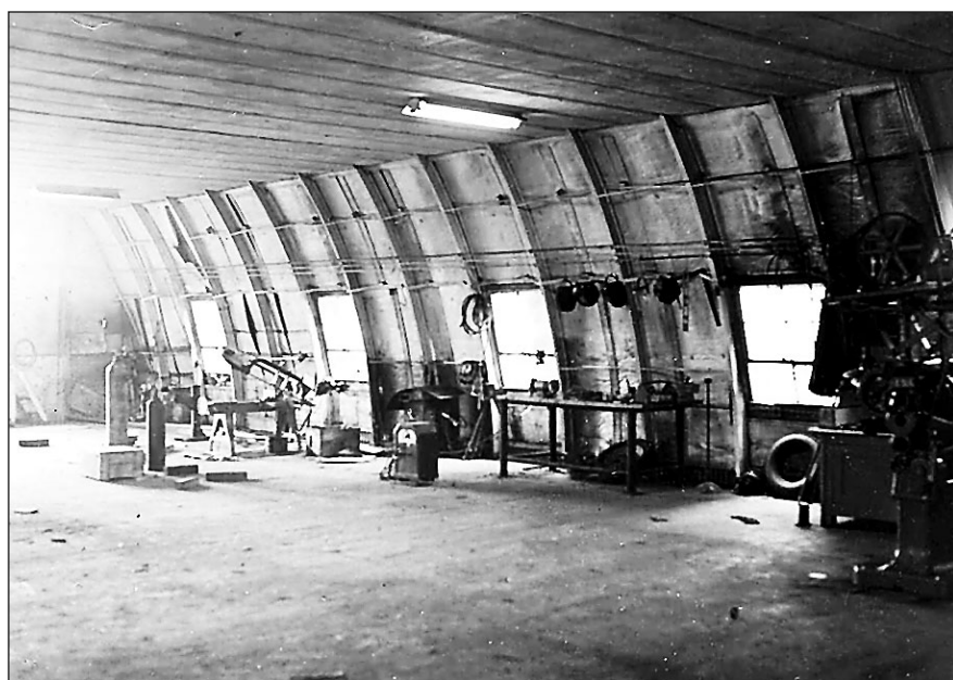
between Third and Fourth streets, 50 watts of power to reach an estimated 500 receivers within a 40-mile radius of Yankton.

Over the next few years the station went on and off the air, often having to accept a part-time broadcast schedule.