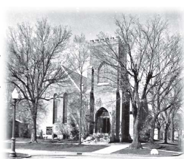
Episcopal Church • 6th & Douglas