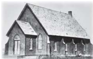
Little Brown Church, 3rd & Walnut